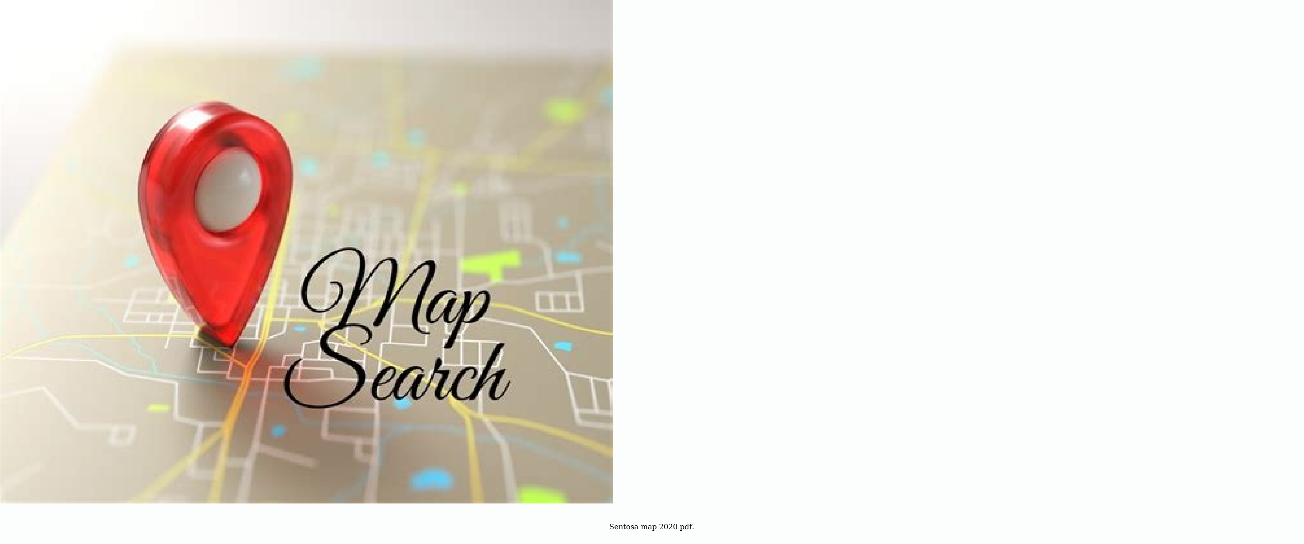
Sentosa map 2020 pdf.